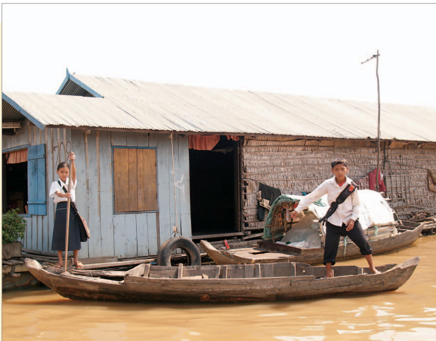
Figure 7 The Tonle Sap is the largest freshwater lake in Southeast Asia. It is adjacent to Angkor Wat in Cambodia. The voice and intangible heritage of the people who live on it is yet to be understood. A partnership with the Cua Van project is being envisaged.

The intangible heritage of the area is now under serious threat, given that the initial focus following