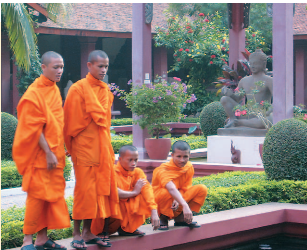
Figure 2 Young novices in the National Museum, Phnom Penh, Cambodia. Can we bring the living heritage of Buddhism, collections and places together?

The Declaration on the Rights of Indigenous Peoples sets the minimum standards, calling for the leadership and participation of indigenous peoples in all endeavours through their own First Voice. UDCD similarly envisages participatory democracy where the First Voice informs intercultural dialogue. In short the First Voice is the voice